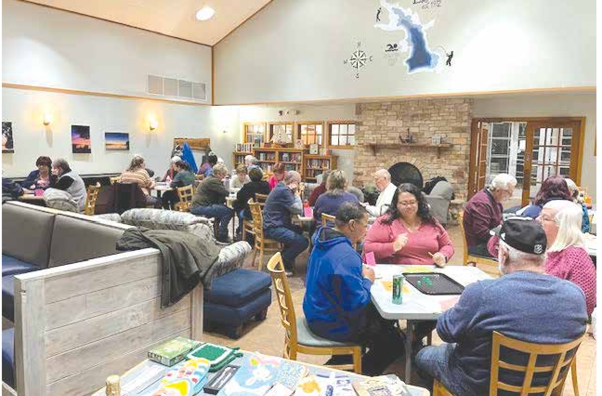
We had 32 players at Bunco on March 1st, we meet the first Friday of the month at 6:30 in the Rec Center.