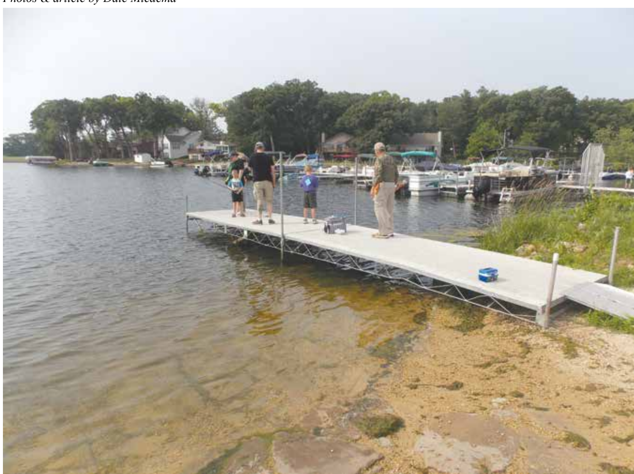
The 2023 CWL Kids' Fishing Tournament begins!