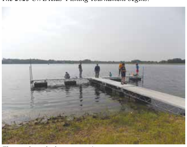
This is where the big ones are!

Again this year, we had great weather for our annual Kids Fishing Tournament put on by the Friends of CWL club. It's a great contest that brings kids from all around the lake down to the Rec center for a chance to see if they can catch that 'Big One', although the size of the fish is not the main goal, as there are many categories in which to win. There were prizes for 'Big Fish, Smallest Fish, and most fish in three different age groups. Each child after checking in, has a card safety-pinned to the back of their shirt, and when they catch a fish, one of many judges stationed around the Rec center peninsula records the length and species of fish on that card, and the fish is released. It's so nice to see Moms and Dads helping their kids, since they are permitted to help the child bait the hook but have to stand back as the child squeals with delight when they catch one!