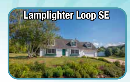
SOLD IN THE FIRST WEEK SOLD FOR 100% OF LIST PRICE