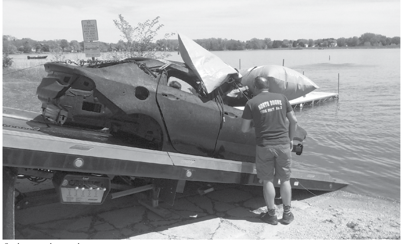
On the way to her next home..