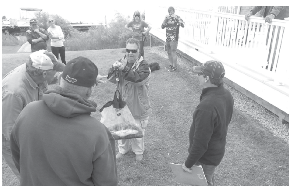
Weighing the catch.