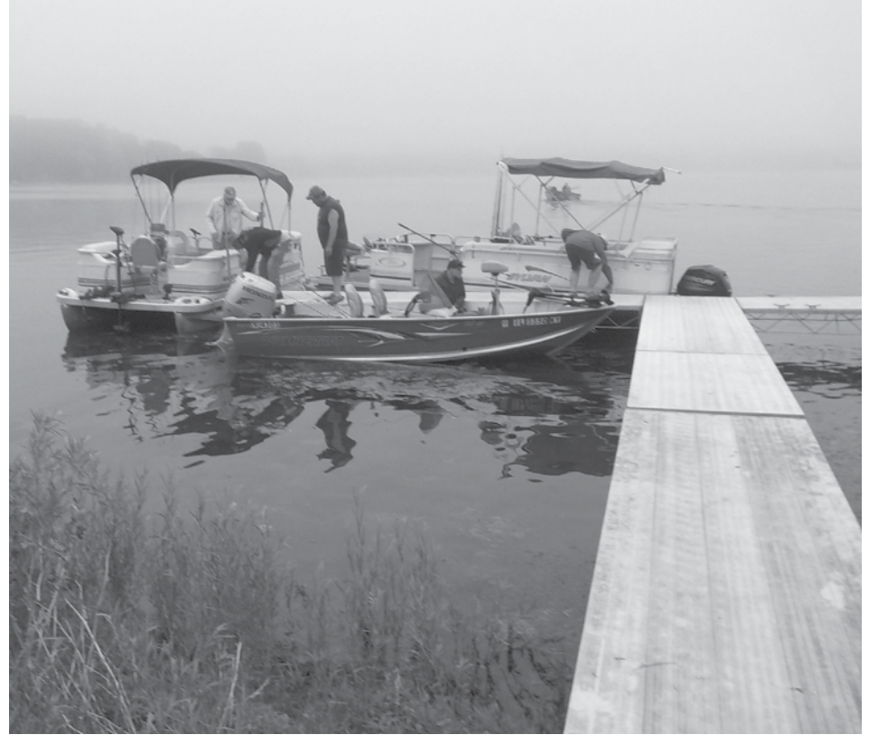
Foggy at the dock.

All the bass caught today were returned to the lake to make sure it remains as an excellent fishery to all our sport fishermen. It don't get any better than that.