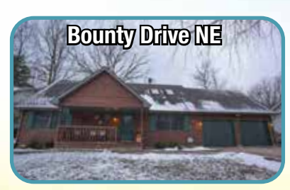
MULTIPLE OFFERS IN 6 DAYS SOLD FOR 100% OF LIST PRICE