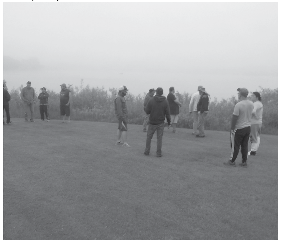
The 6:15 a.m. morning meeting.