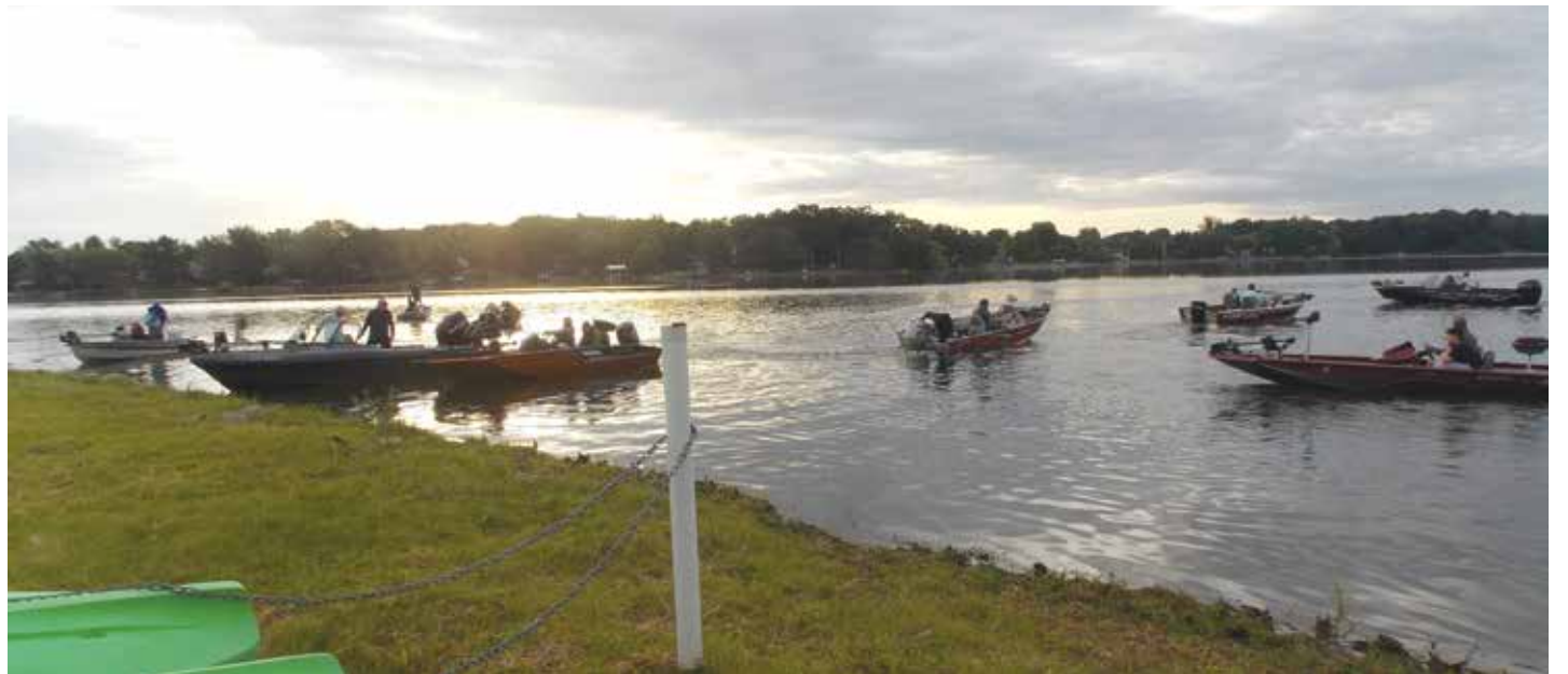
The "Let's Go" has been given!