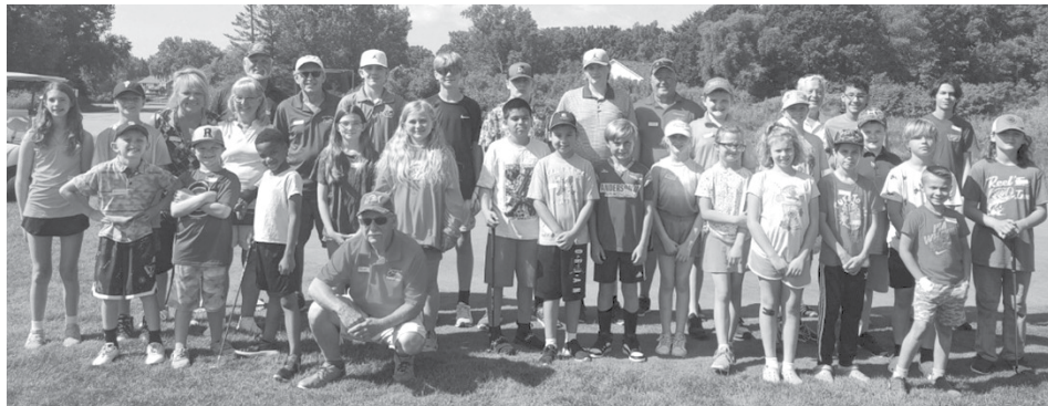
"Tom's Army" 2024 Youth Program Participants

The Youth Program started the season on Thursday morning, June 13th. The kids range in age from 8-17. (Just think how good they will be when they are middle-aged!)