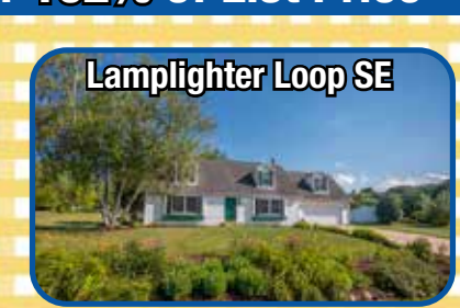
SOLD IN THE FIRST WEEK SOLD FOR 100% OF LIST PRICE