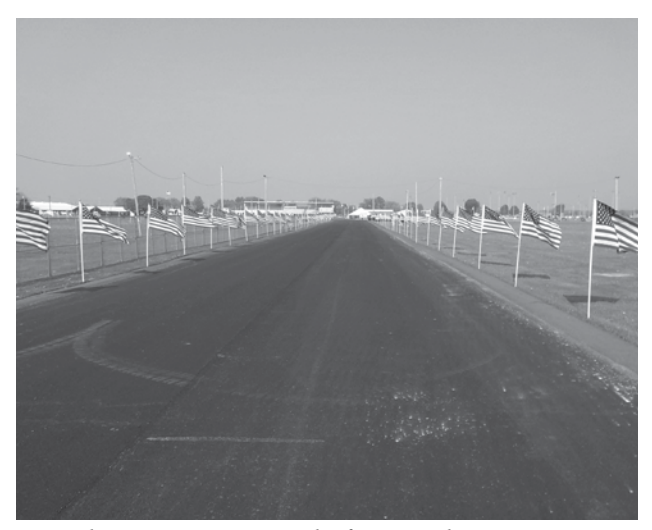
McKinley street entrance to the fairgrounds

These kids are our future, proud of 'em, but I hope and pray they don't see things like our older soldiers did over all these years... Proud of America!