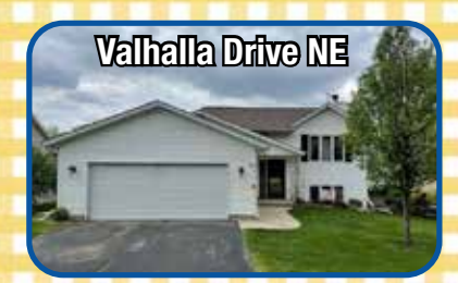
8 OFFERS IN 2 DAYS SOLD FOR 109% OF LIST PRICE