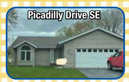
SOLD BEFORE RELEASE SOLD FOR 100% OF LIST PRICE