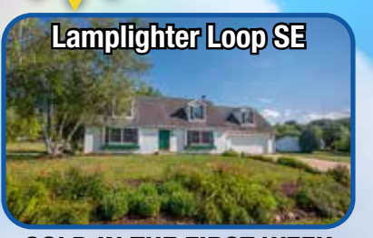
SOLD IN THE FIRST WEEK SOLD FOR 100% OF LIST PRICE

Rain or shine, I'VE GOT YOUR REAL ESTATE NEEDS COVERED ALL THE TIME!