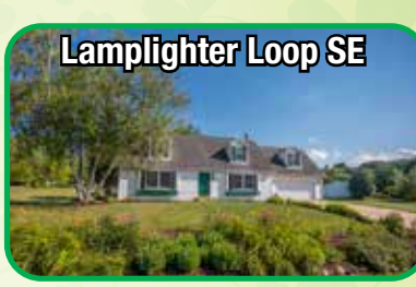
SOLD IN THE FIRST WEEK SOLD FOR 100% OF LIST PRICE