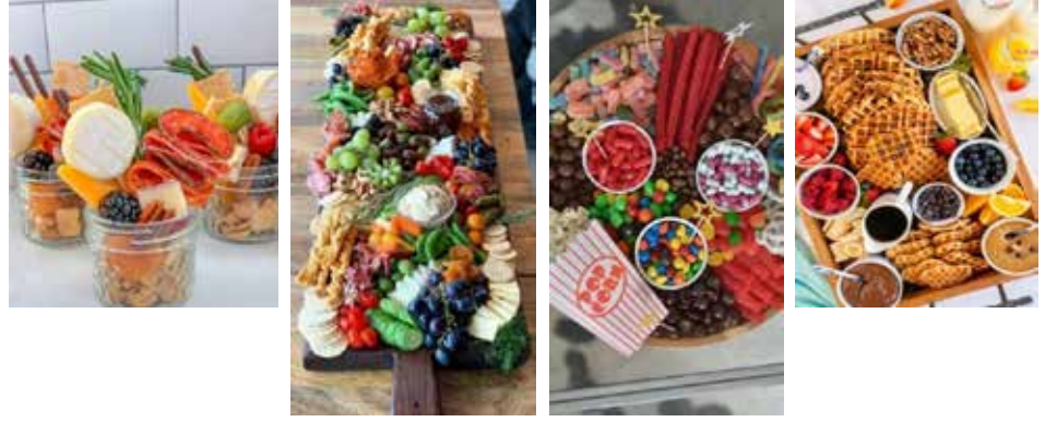
Here is a chart to get you started.

Oh and by the way, giving someone the raspberries is also known as a Bronx Cheer! Just thought you might want to know.