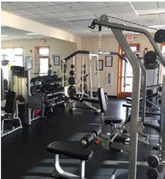
Fitness Center Orientation Classes

This is a free class. Those in attendance choose the DVD for the session.