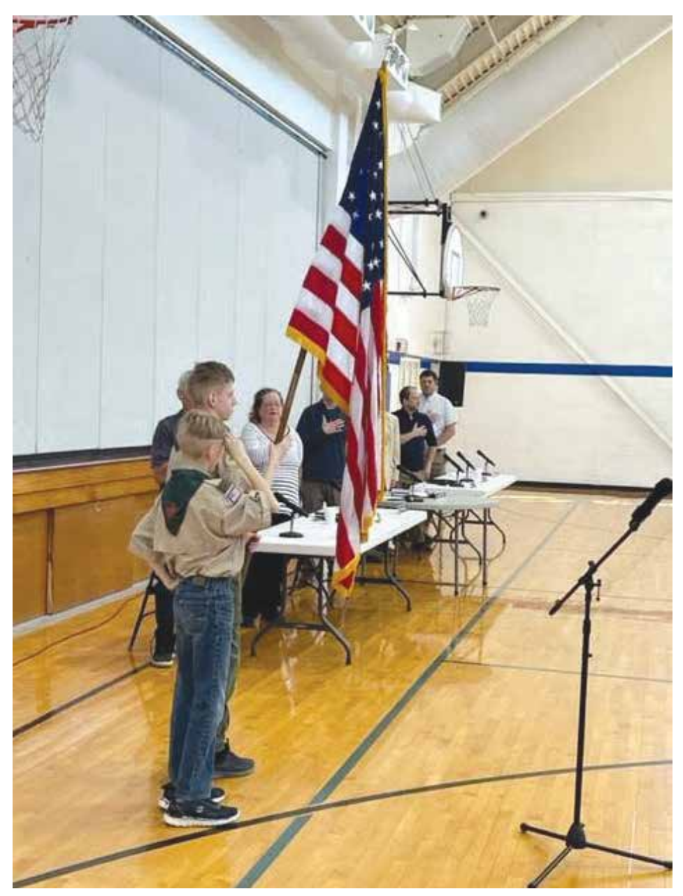
Boy Scout Troup 126 presenting the flag.