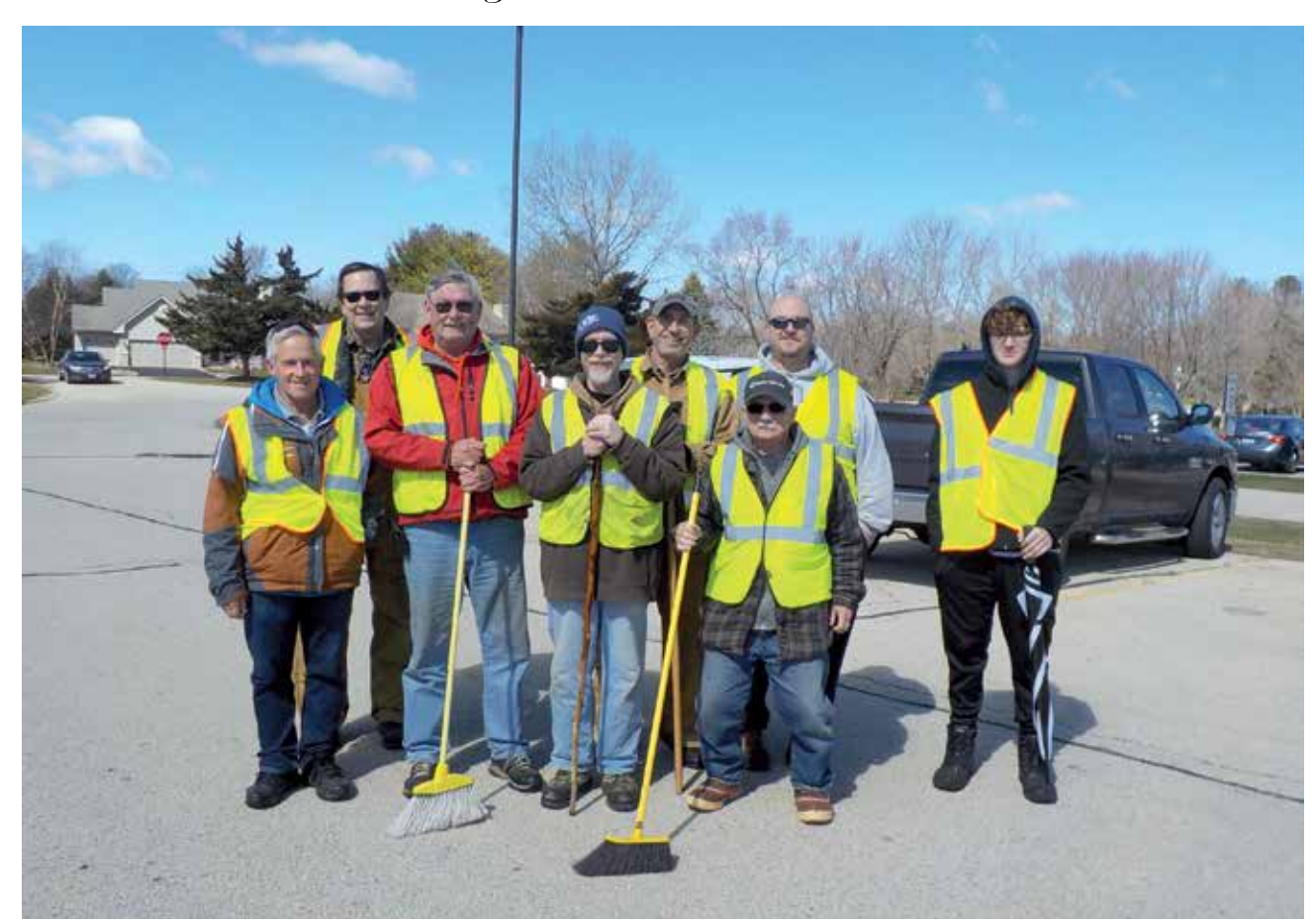
Our first egg addling volunteer group of 2022.

All lots that have a house on them must be mowed on a regular basis so as to keep the property looking neat. Please be reminded that it is the responsibility of each property owner to mow and maintain the ditch area in front of their property. Trimming around utility boxes, sign or mail box posts, trees and any other structure on the lot is also required. Please be sure to mow the entire ditch, up to the road shouldering. If you hire a contractor to mow your lawn or vacant lot, be sure they are aware of the rules as well.