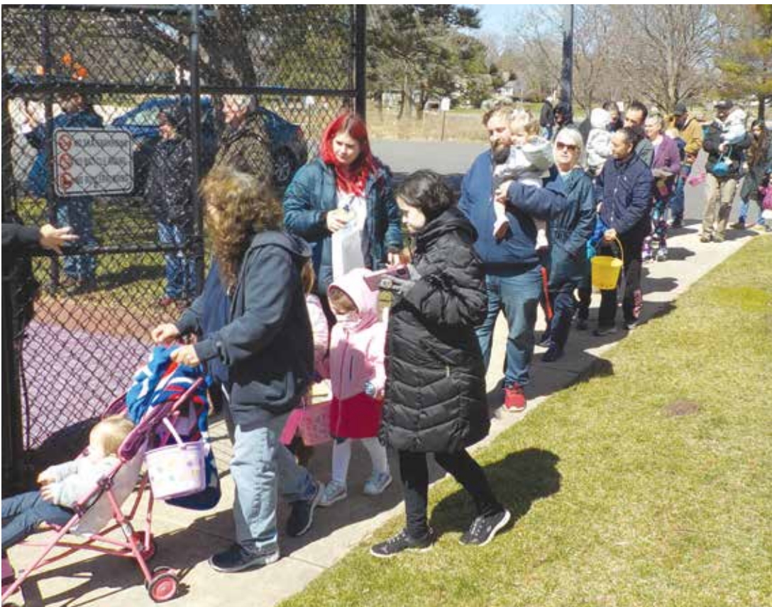
The young ones ready for the hunt.