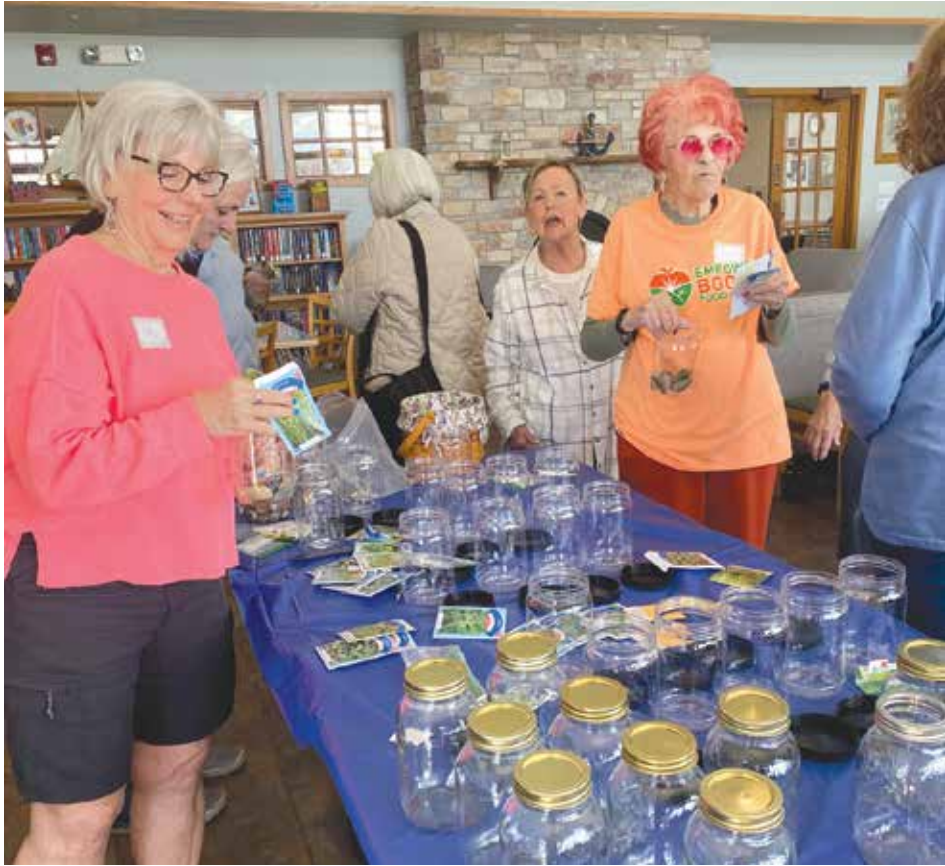
Preparing to label herb jars.