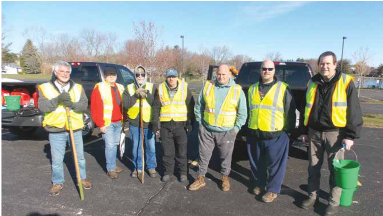
Our 2024 Egg Addling Volunteers

Photo and article by Dale Miedema, Communications