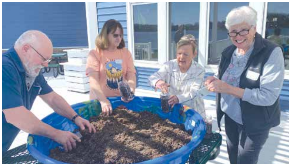
Putting soil in plant jars.