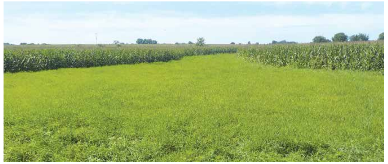
This where most of our lake water comes from. I didn't know we had an agreement with the farmer about leaving this two-acre site open, to help us along.