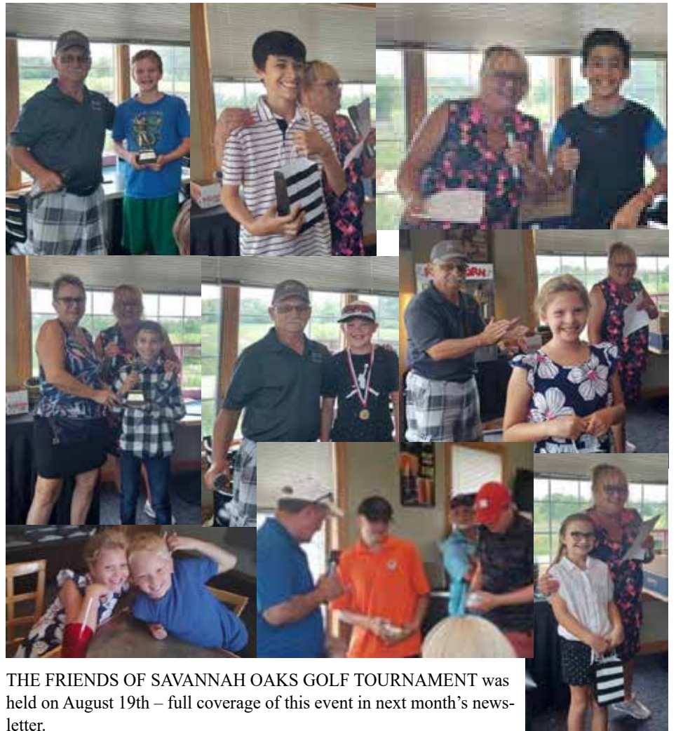
THE FRIENDS OF SAVANNAH OAKS GOLF TOURNAMENT was held on August 19th – full coverage of this event in next month's newsletter.