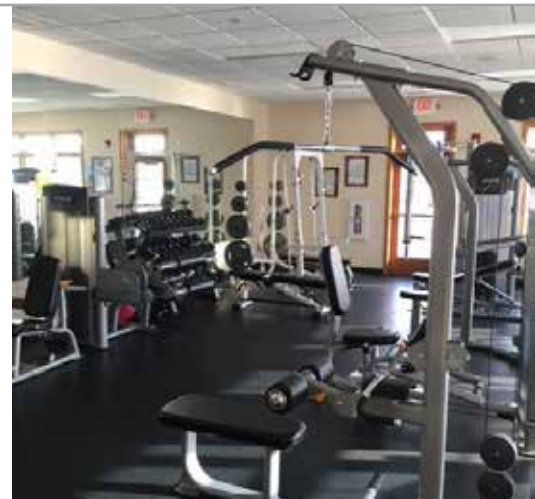
Fitness Center Orientation Classes

Minimum of 6 participants or the class will be cancelled.